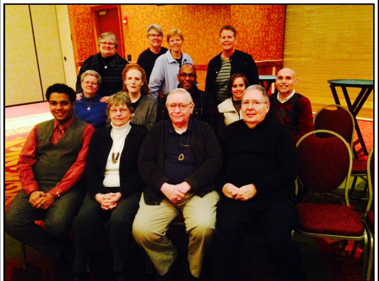
Supporters from Bloomington/Normal attended the breakfast and sat at the PPC tables.

Since its creation in 1999 the Acorn Equality Fund has awarded 132 scholarships totaling $246,000. The organization's primary fundraiser is the breakfast which is an annual event on the first Saturday in December. www.acornequalityfund.org .