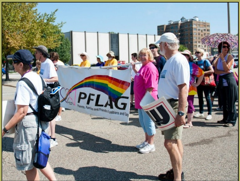
Members of the PFLAG of Bloomington-Normal were proud and excited to take part in the annual Bloomington Labor Day parade in September. This is the first time the group has participated in the parade.

The brown-bag session is part of a lunch and learn series made possible through the museum's partnership with Illinois Wesleyan University and Collaborative Solutions Inc.